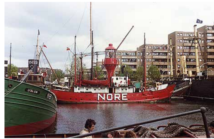
The Nore lightship at St Katharine Docks, 1979.