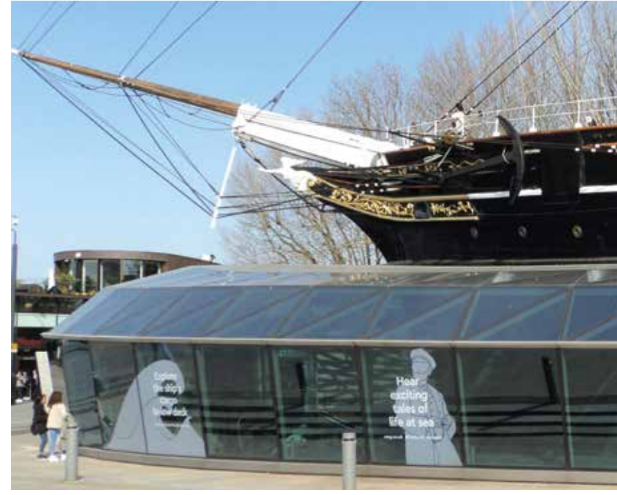
Cutty Sark as a restored attraction.