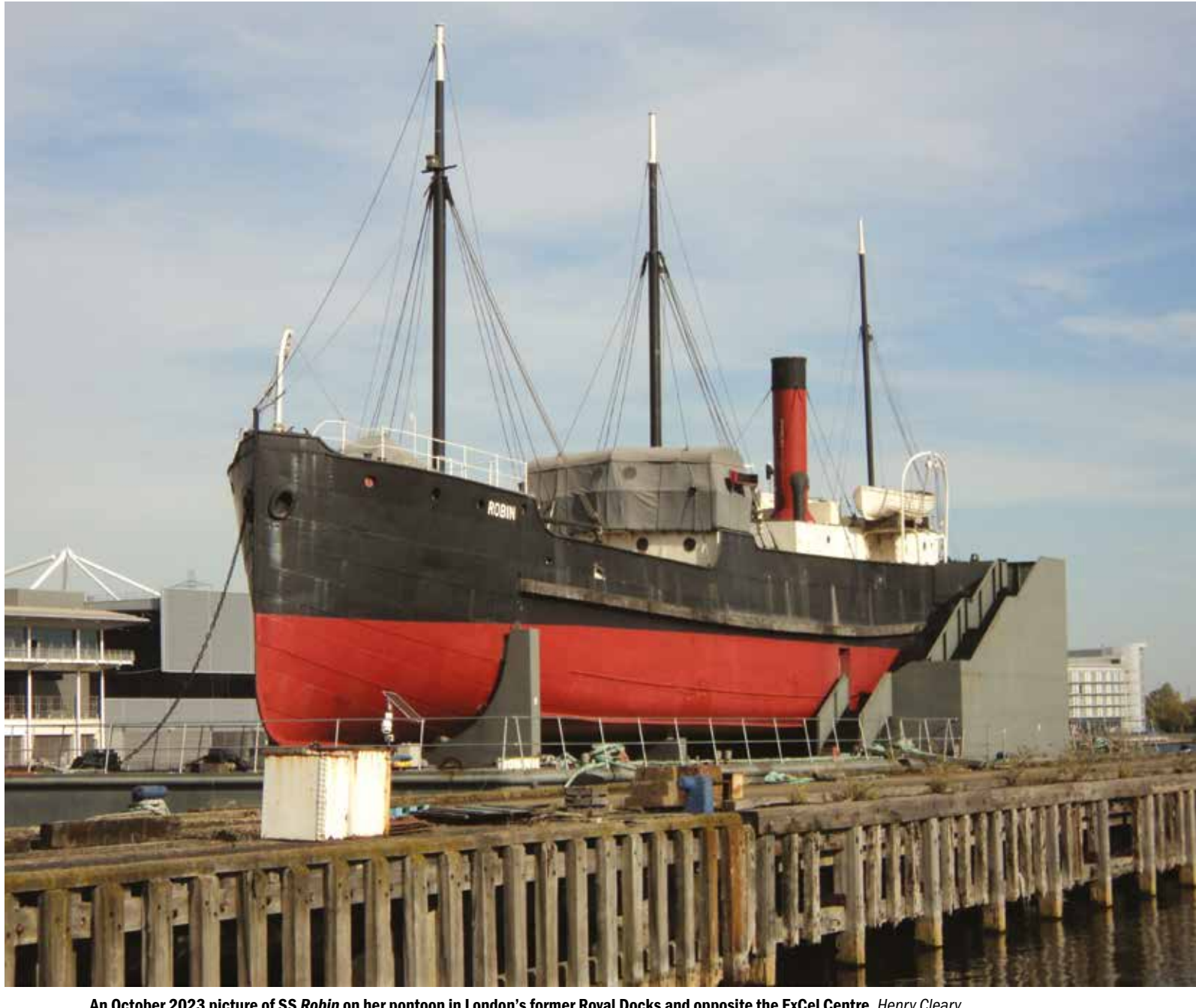
An October 2023 picture of SS Robin on her pontoon in London's former Royal Docks and opposite the ExCel Centre.

Eva, the only surviving steam fishing drifter. With others representing coastal fishing and trades, the Trust had by 1990 helped to save 20 vessels and brought many of them together in a historic ship collection at St Katharine Docks, London. The Trust had also helped manage, broker and help find future homes for vessels such as the Discovery, Gannet and Warrior as well as helping many smaller local projects. From 1973 the Maritime Trust became managers of the Cutty Sark with full merger following in 1989 and became the Cutty Sark Trust in 2000. In 2012 the ship was transferred to Royal Museums Greenwich.