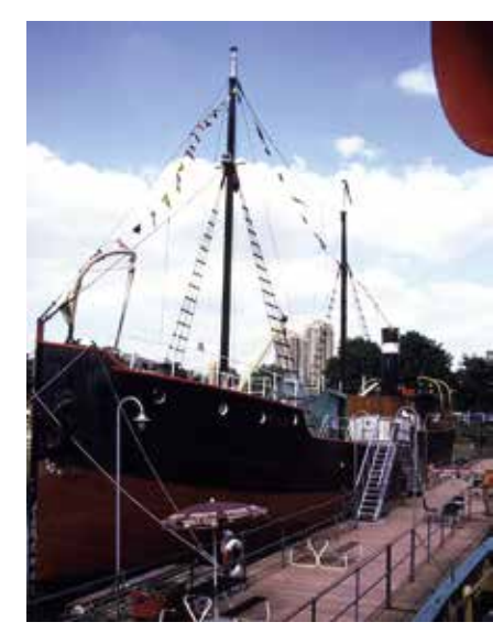
SS Robin when in St Katharine Docks.

Much more high profile was the case of HMS Implacable, formerly the